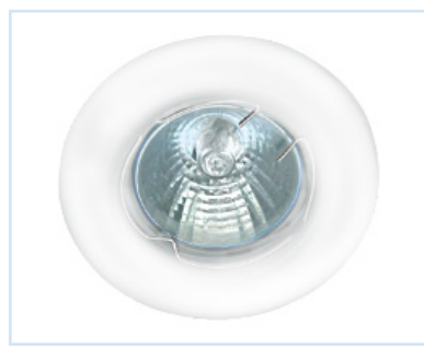
fixed trim halogen