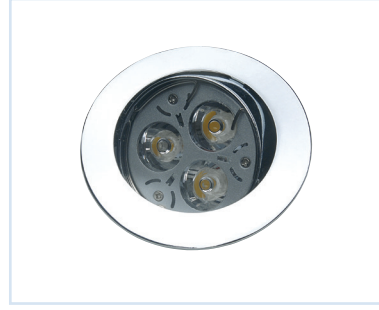
adj. trim LED